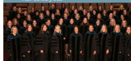
CONGRATULATIONS CLASS OF 2007!