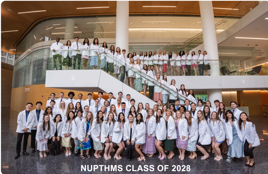
NUPTHMS CLASS OF 2028

progress and resilience across professional education, graduate training, research, clinical programs, and departmental operations, often under challenging and unpredictable conditions. What follows is a more comprehensive accounting of these accomplishments, made possible by the dedication of our faculty, staff, students, residents, fellows, and trainees.