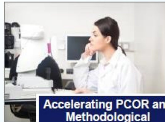
Accelerating PCOR and Methodological Research