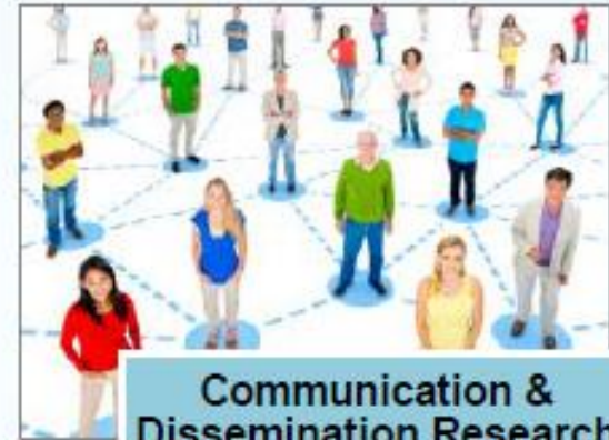
Communication & Dissemination Research