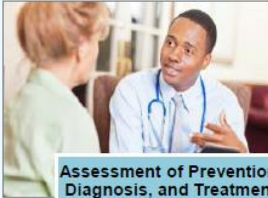
Assessment of Prevention, Diagnosis, and Treatment Options