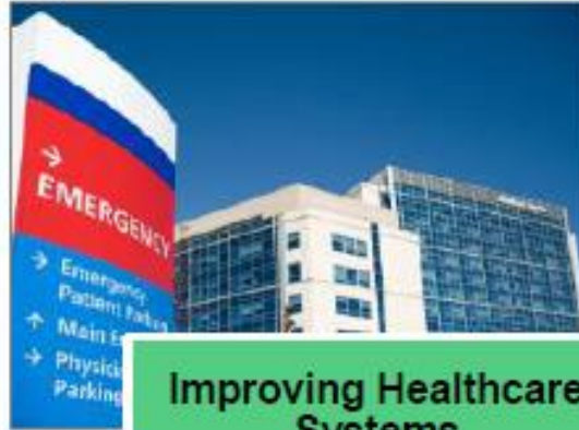
Improving Healthcare Systems