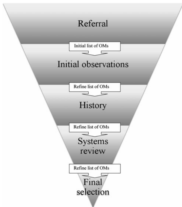
Figure 1. Clinical decision-making framework: the steps in selecting outcome measures. As the physical therapist proceeds through the examination process, she or he refines and narrows the list of possible OMs, leading to the final selection of OM(s).

factors, psychometric factors, and feasibility (Table 1). This framework can be used by clinicians working in any setting, with patients with any type of health condition. In addition, educators can use the framework to teach students how to select appropriate OMs.