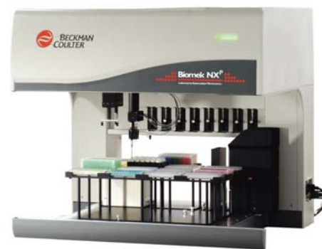
Beckman ArrayPlex NX automated workstation

The facility has also acquired a Beckman ArrayPlex NX automated workstation , purchased with grant funds awarded by the vice president for research's Shared Facilities Program. The workstation will automate the setup of sequencing reactions which will increase productivity.