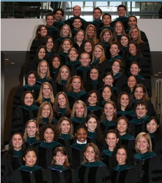
Congratulations! Class of 2006