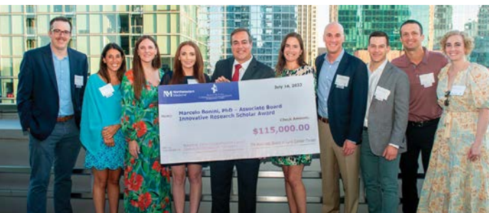
A bridge to the future, the Associate Board of Lurie Cancer Center brings together the next generation of philanthropists who share a common interest in the fight against cancer by raising funds for high-impact research.